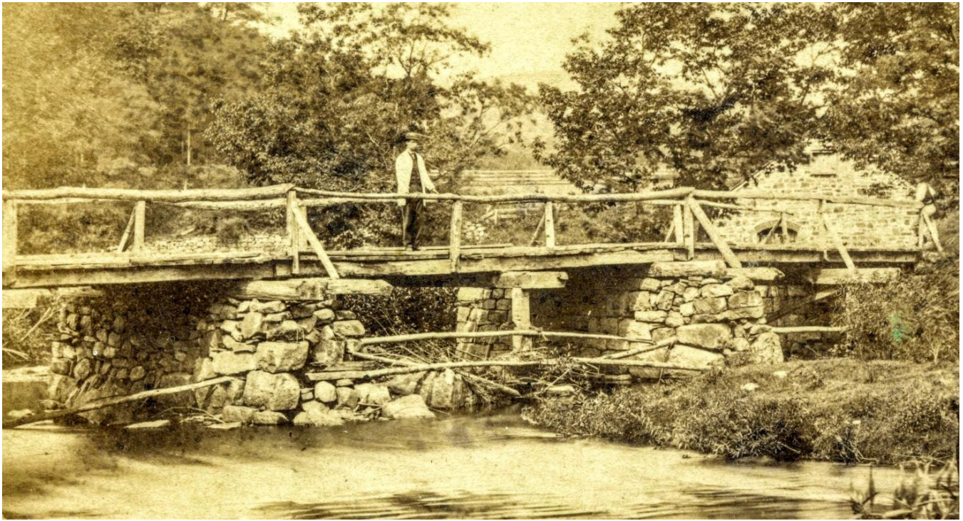
Bridge at Southfields, Stereoscopic Card